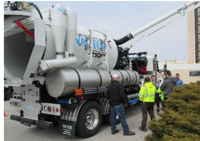
Attendees visit the equipment displayed outside of the hotel